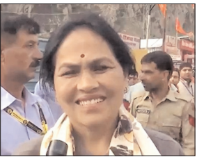
Himalayan Mail News JAMMU, JULY 03

Union Minister Shobha Karandlaje today visited the Amarnath Yatra base camp at Baltal and expressed her joy over the spiritual journey and the ongoing development